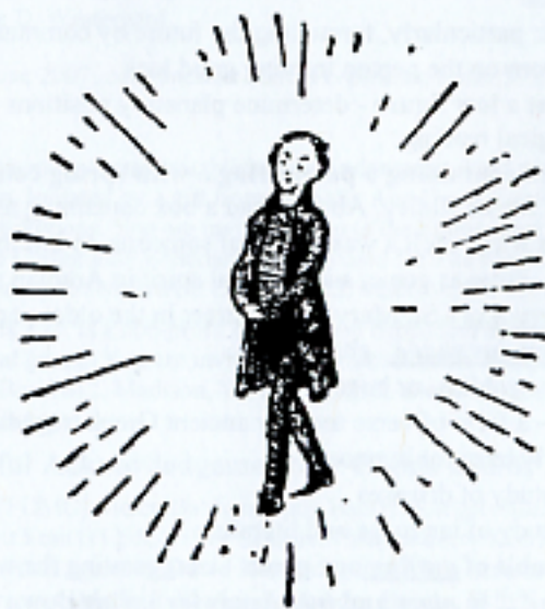
Babs Drawings (Gilbert's own drawings)

Description: Fair young curate (Dr. Daly) surrounded by rays of light